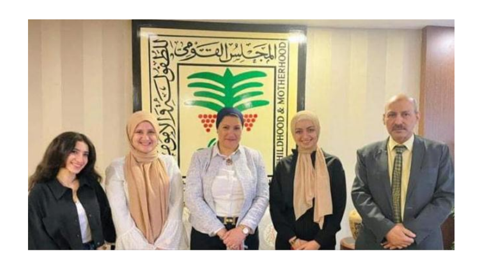
"Mama 140" marketing graduation project team 2021 has succeeded in getting the sponsorship and support of the National Council for Childhood & Motherhood.