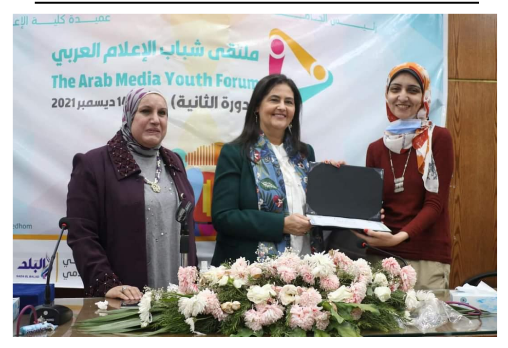
"Discover Mennefer" Destination marketing campaign (graduation project 2021) won the Excellence Advertising Award in the 2<sup>nd</sup> Arab Media Youth Forum held by the Faculty of Mass Communication, Cairo University in December, 2021