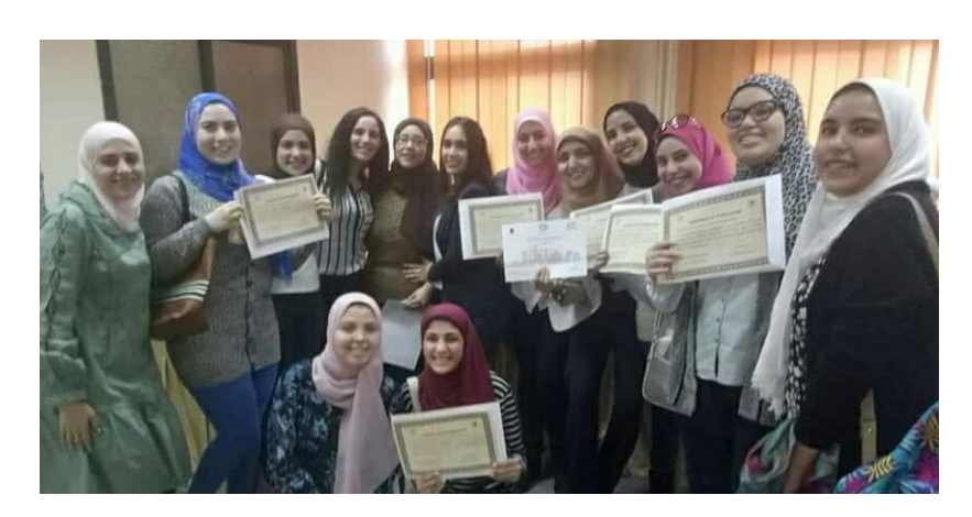
One of the radio ads of "JOE Academy" IMC campaign (graduation project 2017) won the second place as the best radio ad in the first Media Science Cairo Festival held in November 2017.