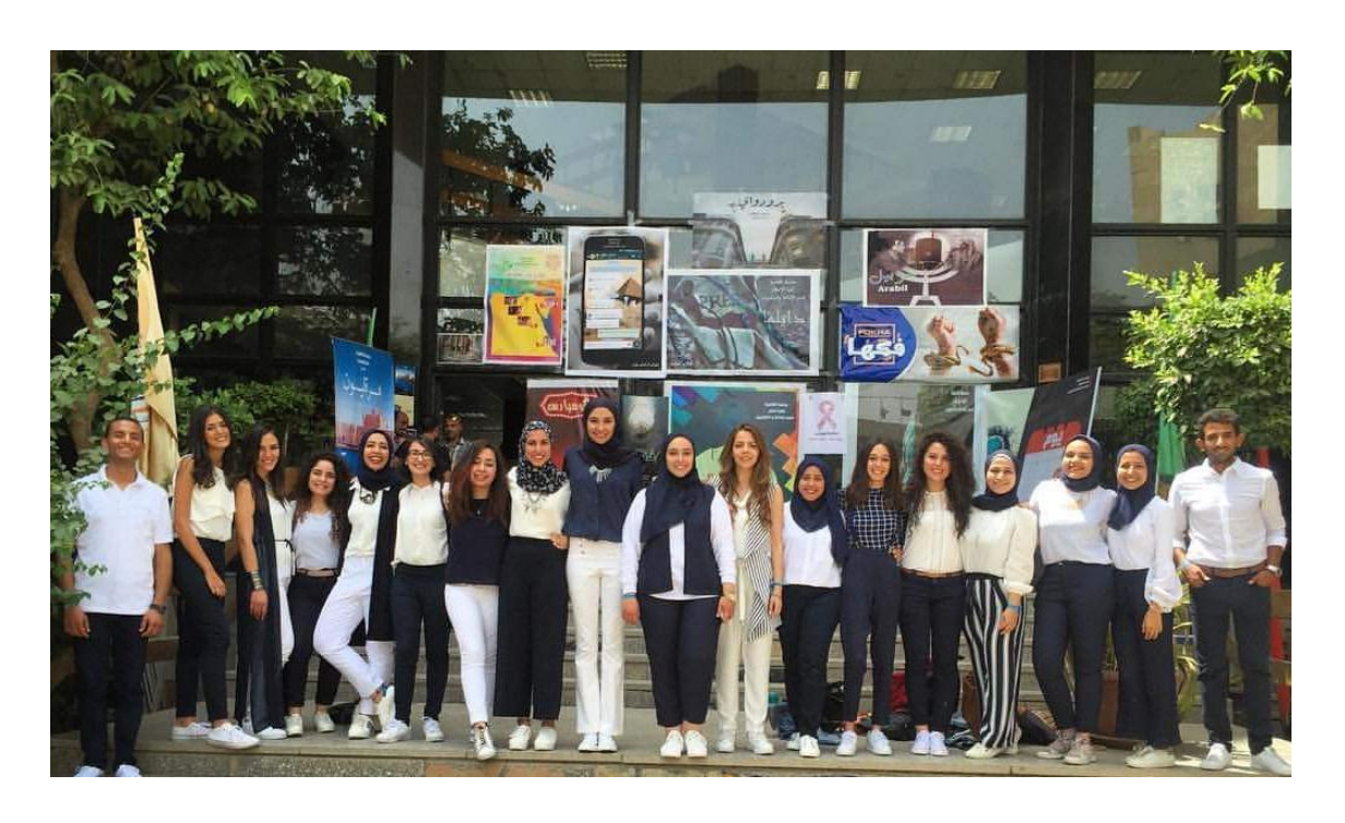
"Camkix" IMC campaign (graduation project 2017) presented their project in "Influence Communications" marketing agency after being invited to do so in front of department heads and staff, 2017.