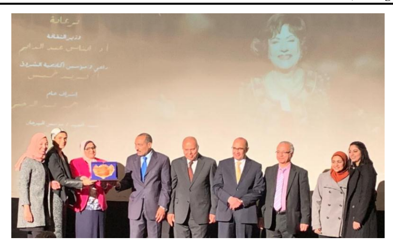
One of the radio ads of "Al Galala" IMC campaign (graduation project 2018) won the third place as the best radio ad in the 4<sup>th</sup> Media Students' Innovation Shorouk Festival held in March 2019.