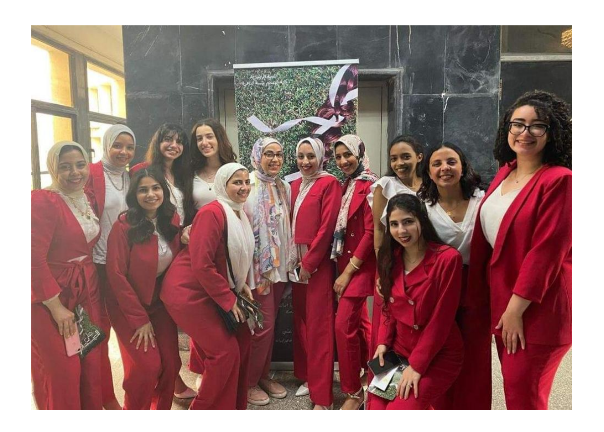
"Hely El-Dfayer" documentary won the Best Video Graduation Project in the Media Creativity Competition organized by the Media & Digital Transformation Foundation, August 2022.