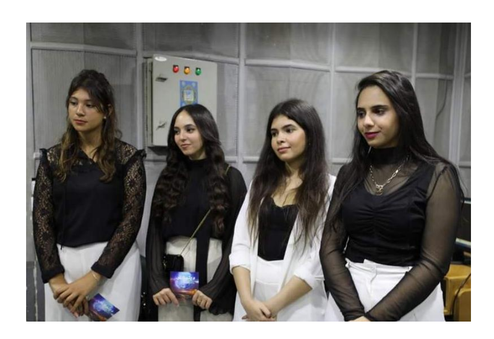
"Detox" won the Best Radio Graduation Project in the Media Creativity Competition organized by the Media & Digital Transformation Foundation, August 2022.