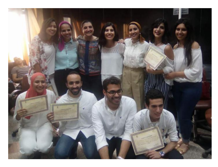
"Gowa El-Sandooq" documentary (graduation project 2017) won the best documentary in the first Media Science Cairo Festival held in November 2017.