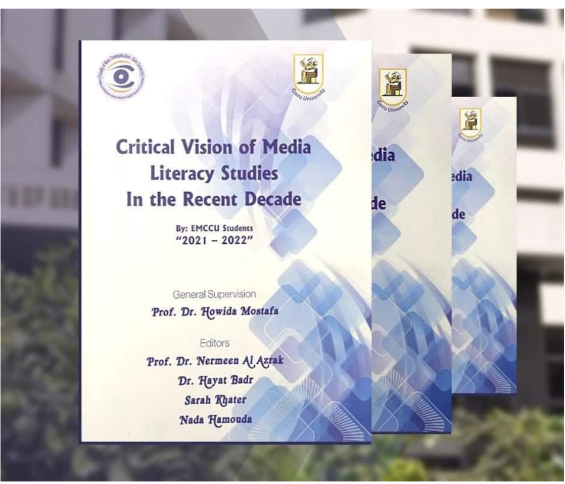
The 1st research book to be done by undergraduate students in the Faculty of Mass Communication. EMCCU Sophomores conducted various review analyses about different topics, as a part of their Media Literacy course, which were assembled and presented in the book entitled "Critical Vision of Media Literacy Studies in the Recent Decade", August 2022.