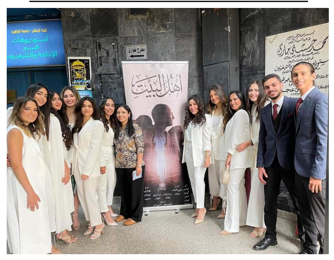
"Ahl El-Bet" documentary won the 2<sup>nd</sup> place in the Documentaries' Category of the African Competition in the Media Creativity Competition organized by the Media & Digital Transformation Foundation, August 2022.