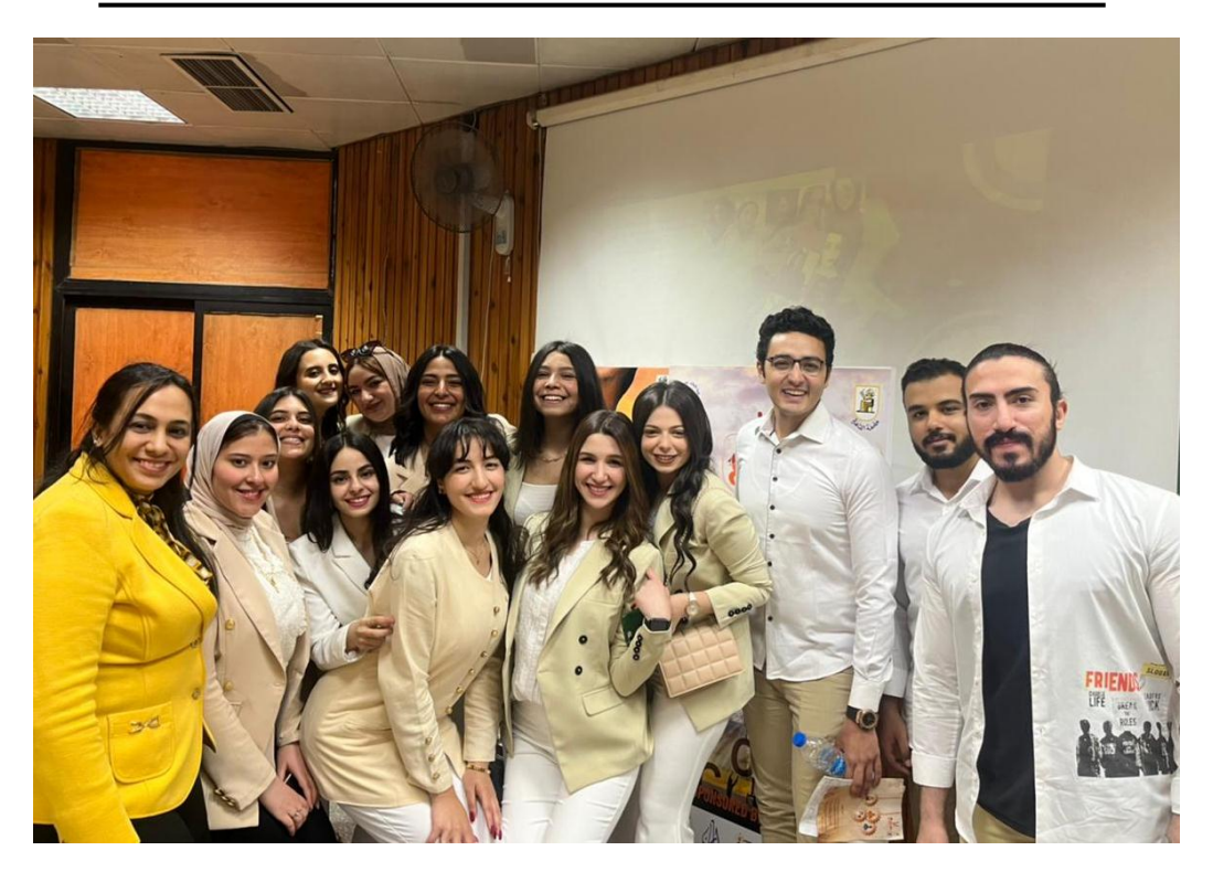
"7 Sanayea" marketing graduation project team 2022 has succeeded in getting the honorary sponsorship of the Ministry of Education and Technical Education and in reaching a collaboration with the Ministry of Youth and Sports.