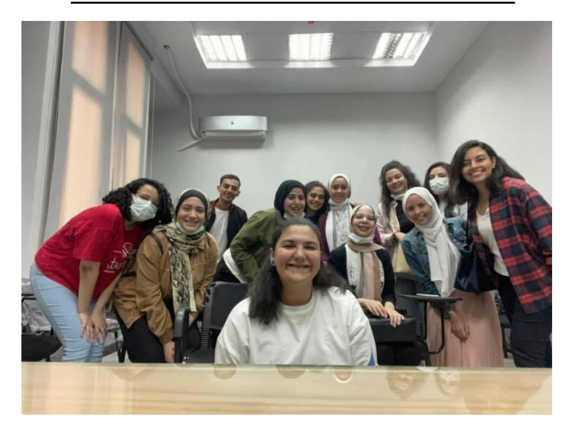
"Maqdeya" marketing graduation project team 2022 has succeeded in getting the honorary sponsorship of the Ministry of Youth and Sports and in getting the support and collaboration of the Information Technology Industry Development Agency (ITIDA).