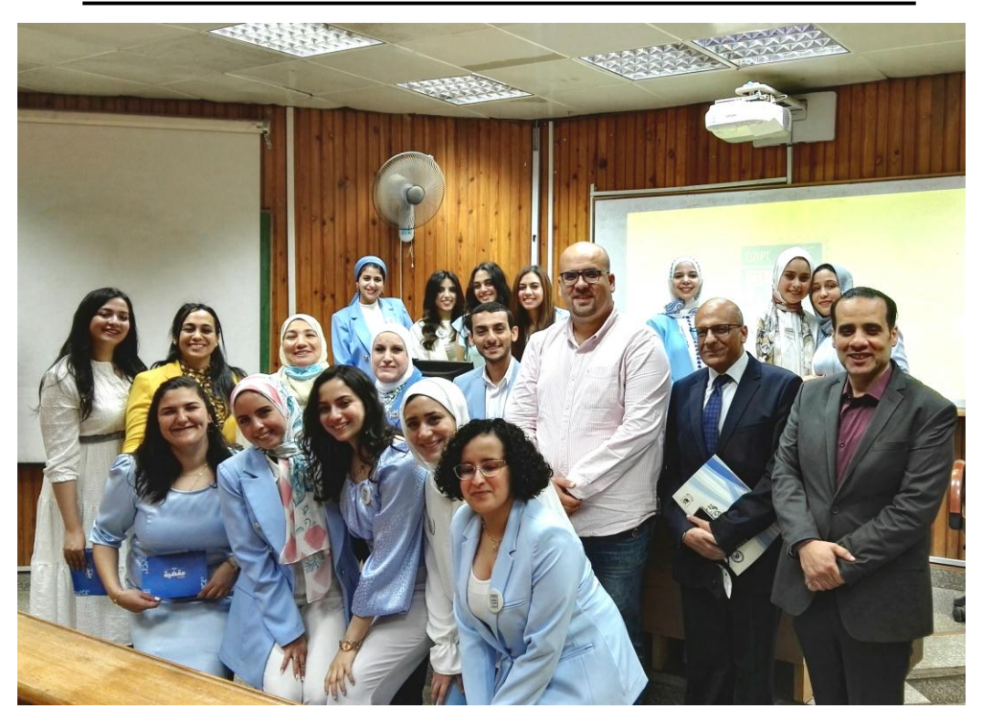
"Maqdeya" won the Best IMC Graduation Project in the Media Creativity Competition organized by the Media & Digital Transformation Foundation, August 2022.