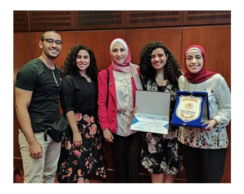
"Ghorbet-19" documentary's song (graduation project 2021) won 2<sup>nd</sup> place in the video clip category in El-Shorouk Academy 6<sup>th</sup> Festival for Students' Graduation Projects, October 2021.