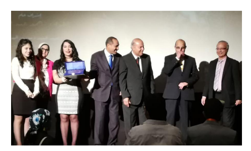
"Mojo" website (graduation project 2018) won the third place as the best Electronic Journalism project in the 4<sup>th</sup> Media Students' Innovation Shorouk Festival held in March 2019.