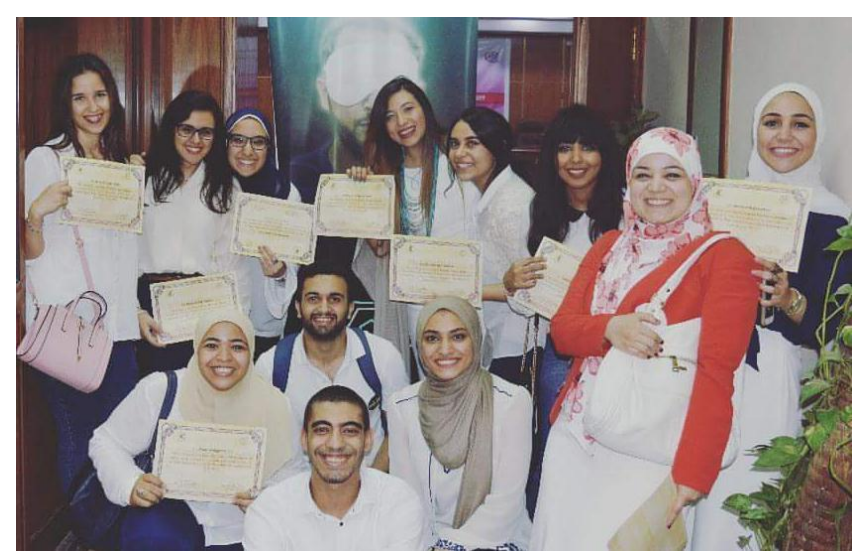
"Voy" documentary (graduation project 2017) won the best short documentary film in the Students Competition which was part of The Ismailia International Film for Short films & documentaries held in April 2018.